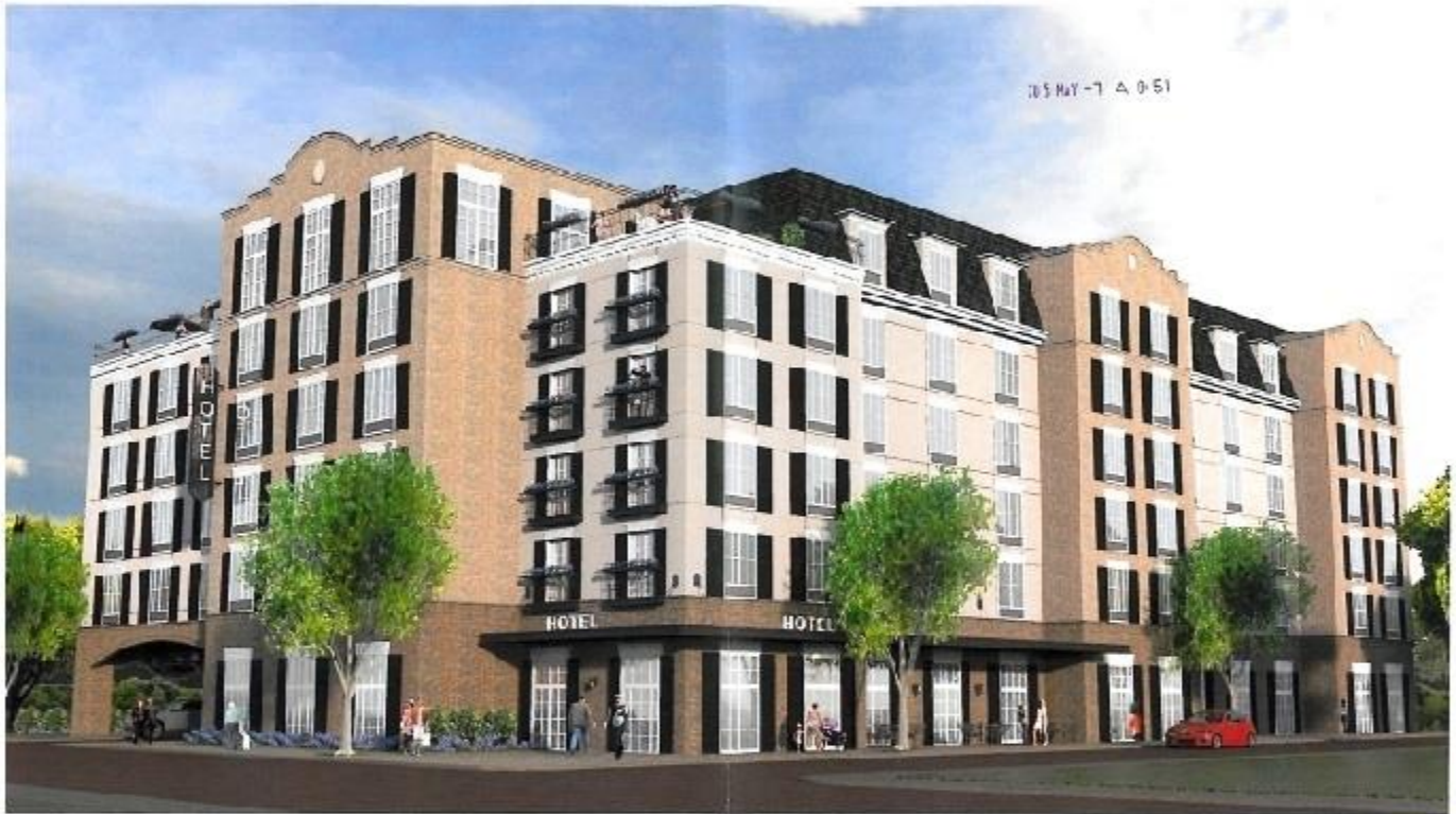
Royal Street Hotel Mobile, Alabama