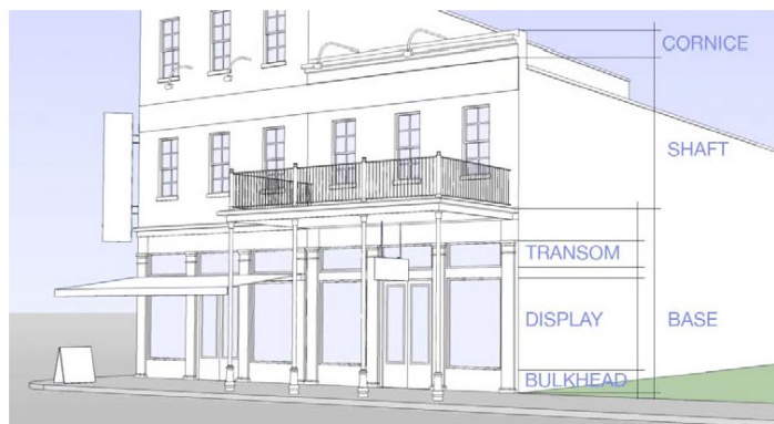
Figure A-10.1 Shopfront Elevation Elements

Cornice: Trim required at the eave or top of parapet. May include one or more habitable floors for buildings over 6 stories.