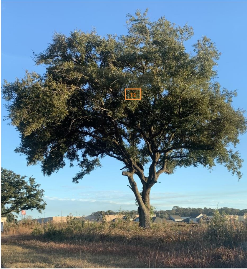
T2 canopy and form