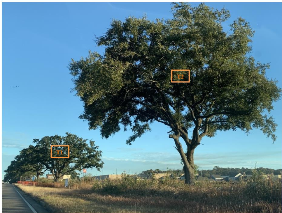
View from south looking north.