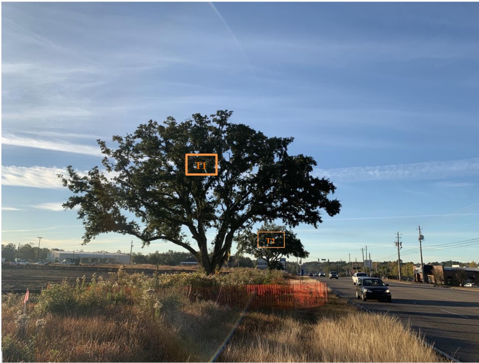
View from north looking south.