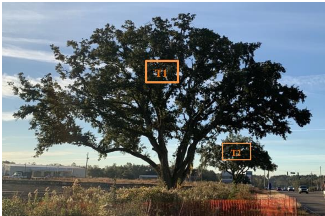
T1 canopy and form