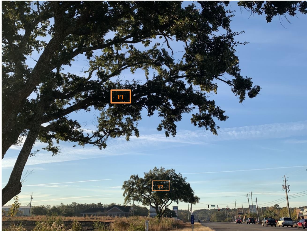
T1 canopy and form