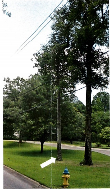
Tree No. 3: 16" Water Oak