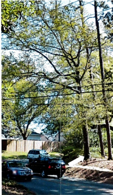
Tree No. 2: 16" Oak