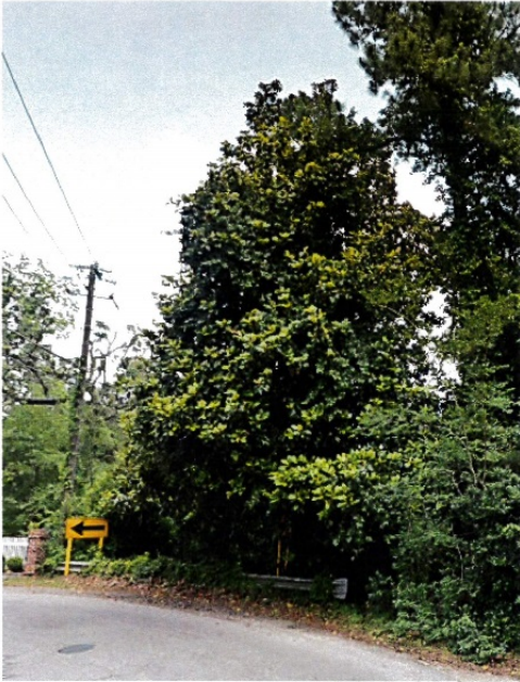
Tree No. 1: 24" Magnolia