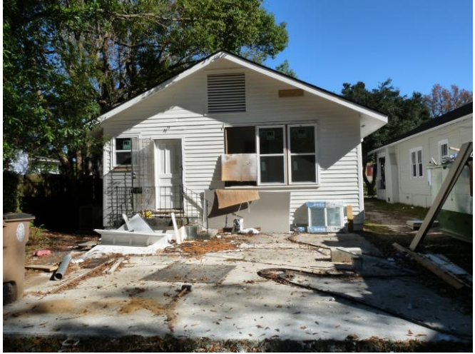
6. Rear (west) elevation