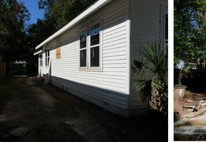
5. South elevation