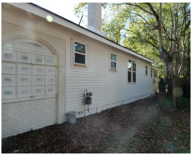
4. North elevation